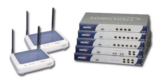
Figure 1: Secure Wireless Solution – PRO Series Internet security appliances and SonicPoints (APs)

Building on the innovative single point wireless solutions, SonicWALL's Secure Wireless Solution addresses larger network requirements. The SonicWALL Secure Wireless Solution consists of a SonicWALL TZ 170 or PRO Series Internet security appliance (PRO 2040, 3060, 4060, or 5060) running SonicOS Enhanced 2.5 or greater combined with dual radio 802.11a/b/g access points, called SonicPoints.